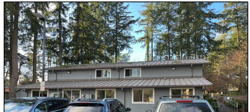
Olympia Reentry Center

The OCO completed visits to every DOC prison and reentry center in 2024.